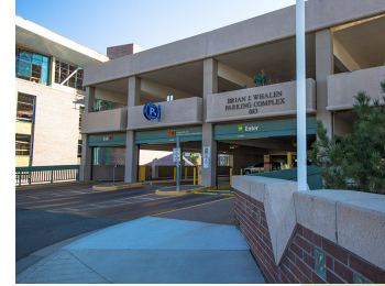
Whalen Parking Complex